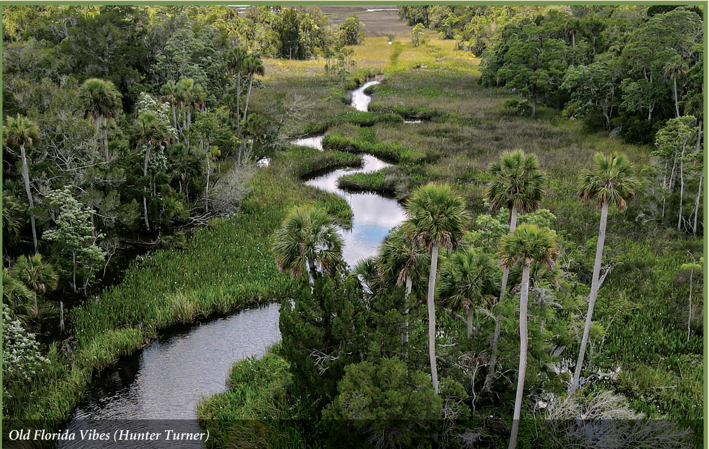
Old Florida Vibes (Hunter Turner)