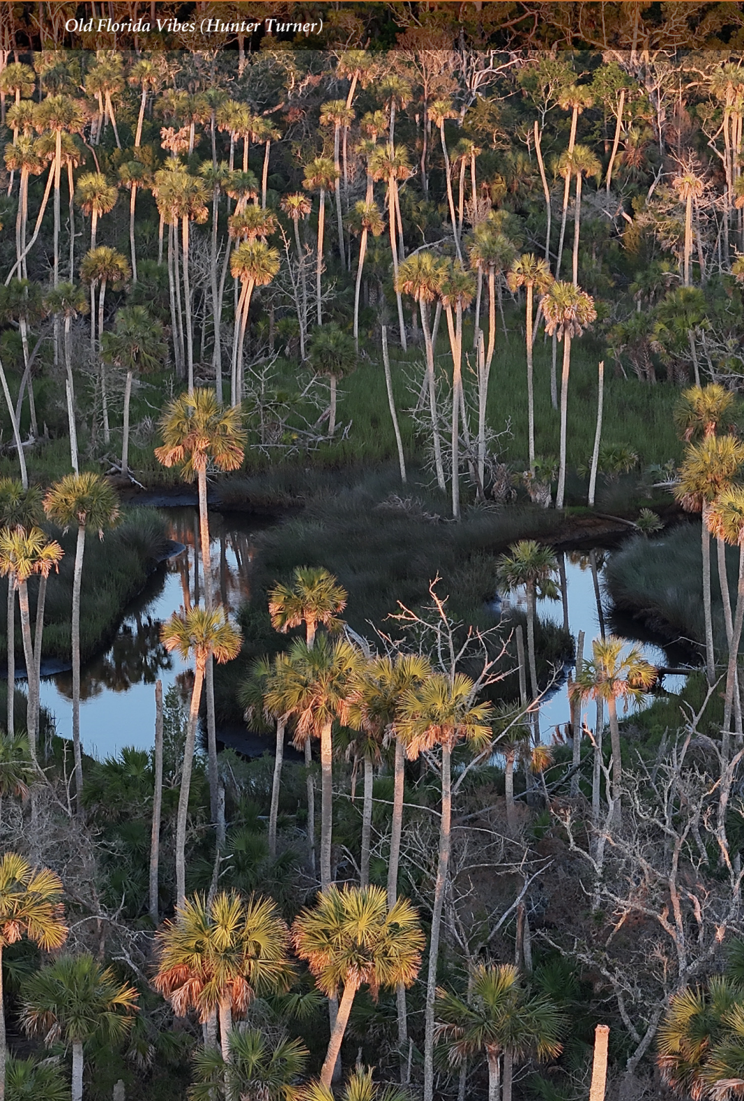
Old Florida Vibes (Hunter Turner)

NON-PROFIT ORG. U.S. POSTAGE PAID PERMIT 282 Tallahassee, FL