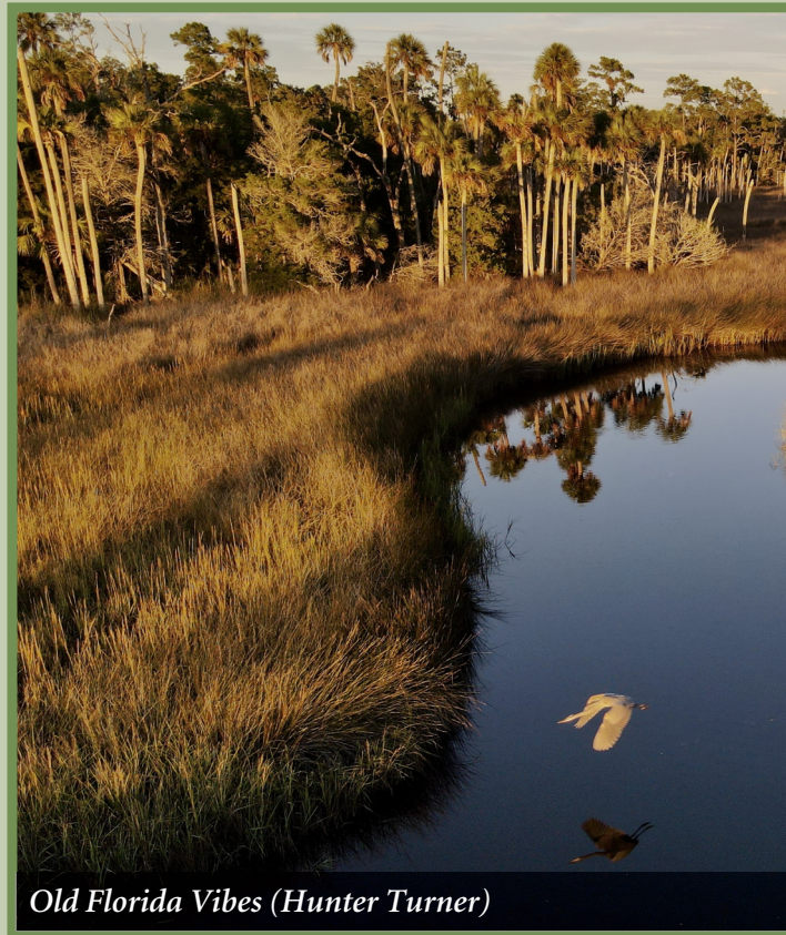
Old Florida Vibes (Hunter Turner)

sponsored by the Guardians of Martin County — we analyzed future development scenarios, with a focus on the county's largely undeveloped western lands. We confirmed that the overwhelming majority of those lands are environmentally valuable and priorities for conservation. Our analysis also found that the county could fully absorb its projected population growth by 2040 within its existing urban services districts with only a modest increase in development density, and preserve its cherished western lands.